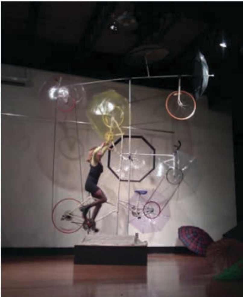
"Bicycles & Umbrellas" Kinetic Sculpture Collage Festival